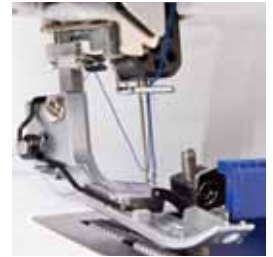
Automatic needle threader