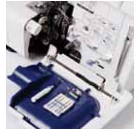
Built-in accessory storage