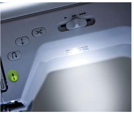
LED lighting Extra-bright triple LED sewing light effectively lights your stitching, making your projects clearer to see.

Save your favourite settings for frequently used stitches. Settings include stitch width or length, needle position, auto reverse/ reinforcement and automatic thread cutter.