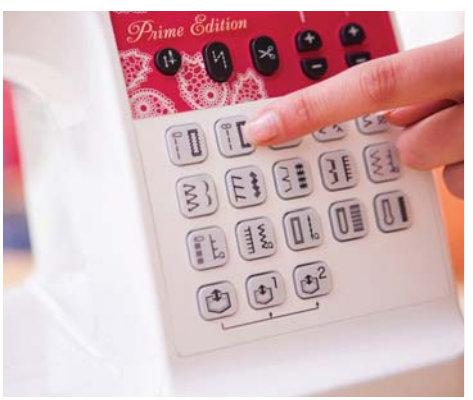
Direct stitch selection Quickly and simply select the required stitch from the keypad.