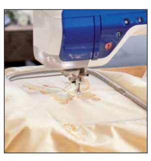
Large embroidery area 300 x 180 mm

Create large embroidery designs with no need to re-hoop.