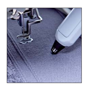
Ultrasonic Pen For easy pattern placement.

Direct dual feed for thin or layered fabrics.