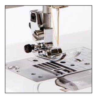
Automatic electronic needle threading

Handy central controls help to make sewing simpler and electronic touch pads provide finger tip control of machine functions.